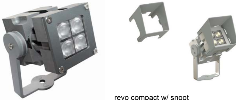
revo compact w/ snoot

Technical Description: Revo Compact Series